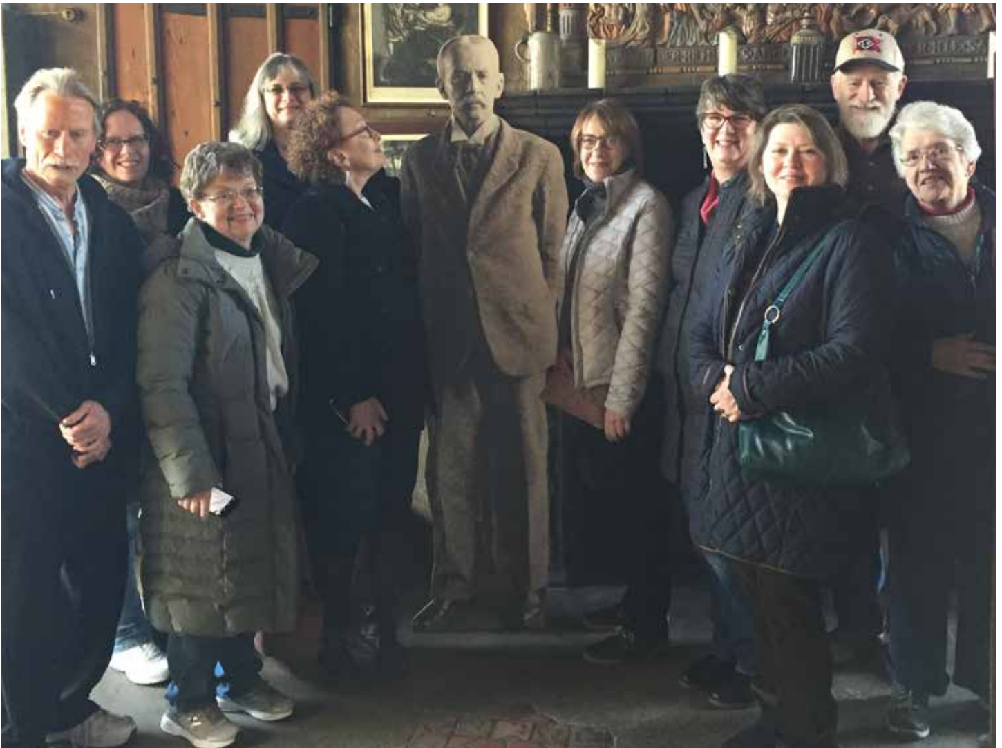
The group had fun posing with Henry Chapman Mercer (sort of) in the salon, the main gathering room at Fonthill Castle.