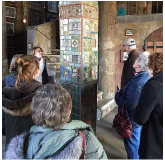
Taking in a column of tiles that span centuries: ancient Babylonian writings on clay are mixed in with Moravian tiles.

The February meeting was a field trip to Fonthill Castle in Doylestown, PA on Saturday morning, February 8th. Eight members and two guests toured this unique home. As the Fonthill website explains, "Built between 1908-1912, Fonthill was the home of Henry Chapman Mercer (1856-1930). Archaeologist, anthropologist, ceramist, scholar and antiquarian, Mercer built Fonthill both as his home and as a showplace for his collection of tiles and prints." And there are tiles everywhere on all surfaces: floors, ceilings, fireplaces, columns...you name it. Most are Moravian tiles made at the Moravian Tileworks just on the other side of some woods as Fonthill, but several were from other parts of the world including The Netherlands, India and Middle Eastern countries. The castle is made of poured concrete so most of the tiles were pressed into that substance when the house was being built. Those on the tour enjoyed learning about the history of Fonthill while taking in a number of rooms, from the salon to private bedrooms to Mercer's study. It was an informative and entertaining time!