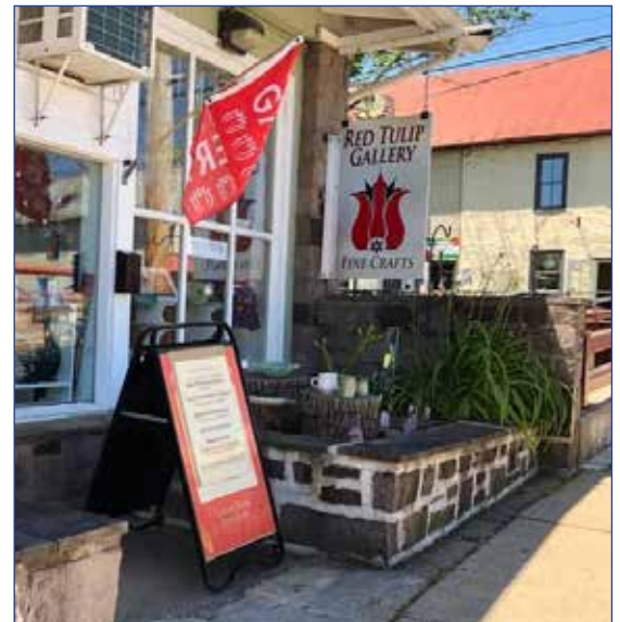
Red Tulip Gallery has reopened on a limited basis. Below are some examples of the art offered online at discounted prices during the lock down.

Other contact info: (267) 454-0496 info@redtulipcrafts.com